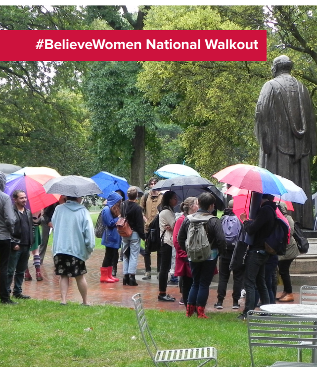
#BelieveWomen National Walkout