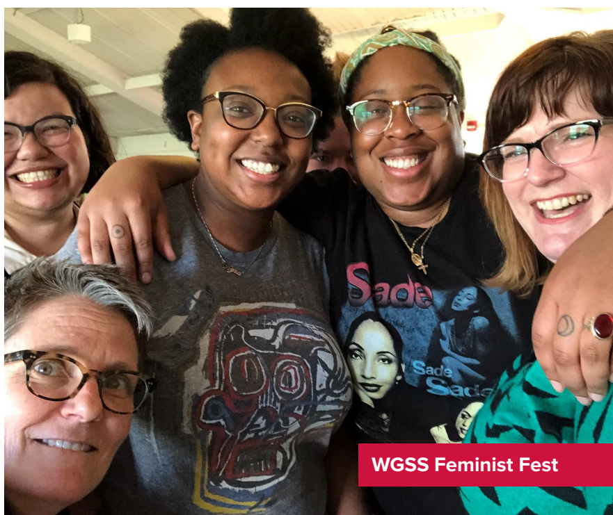
WGSS Feminist Fest