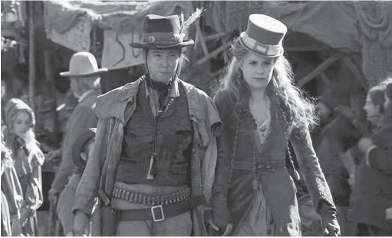
19. Jane and Joanie. "Amateur Night" ( Deadwood 3.9).

holding hands, Jane intoxicated and holding onto Joanie for support, but clearly walking in public as a couple. Bookending the procession, the two couples become the public signifiers of community-building and the future of the West. While these two pairs, heterosexual and homosexual, are traditionally designated as legitimate/illegitimate, this is a binary dynamic of the Western that Deadwood continually exposes and erodes. 13 The breakdown of this particular binary begins in season 3, episode 4, which concludes with the parallel scenes of three couples: Jane and Joanie awkwardly shaking hands as they agree to live together; the Bullocks holding hands and conversing in bed; and Swearengen getting fellated by the young prostitute Dolly, whose humanity he suddenly realizes through a touching conversation about his childhood memory of being forcibly restrained.